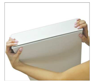
PEEL ADHESIVE LABEL AND FOLD FLAP TO SEAL BOX