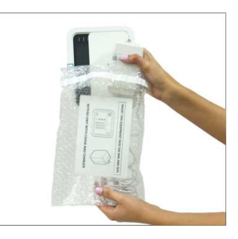
PLACE DEVICES IN BUBBLE BAG WITH MATCHING PICTURE

STEP 5: PACKAGE BASE UNIT, KEYPAD(S) AND CABLES