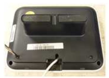
PLACE KEYPAD FACE DOWN ON LEVEL SURFACE